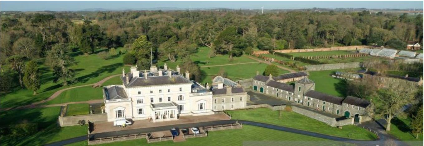
Ballywalter Park – Where we will stay for two-nights

Tour arrangements by Classical Excursions