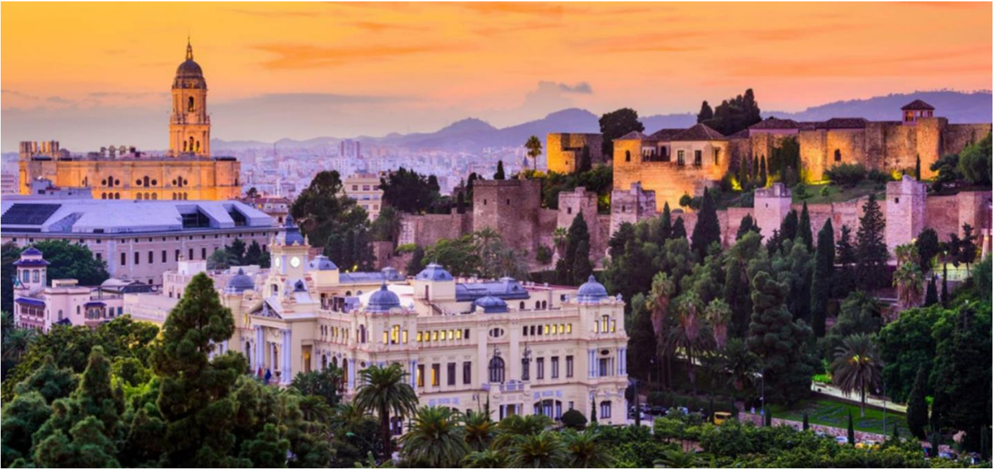
IMAGE OF THE HISTORIC CENTER OF MALAGA