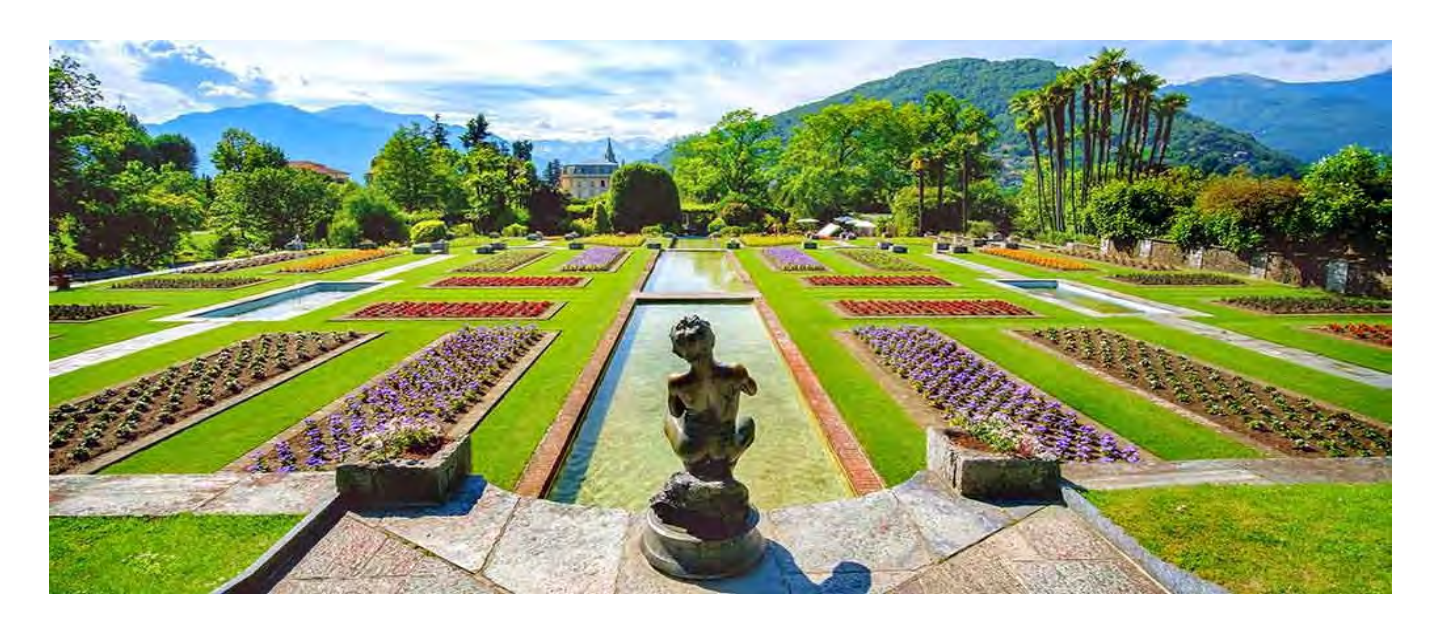
VILLA TARANTO in Pallanza, which is now a botanical garden (above). The garden was created by a Scotsman in 1931 on a property that dates much further back. The garden was opened to the public in 1952, and the villa is used for exhibitions, records storage and offices.

VILLA CARLOTTA: A private tour on Lake Como of the magnificently sited Villa Carlotta at Tremezzo positioned at the top of a series of terraced gardens. They are designed to look out of as well as look into—the panoramic views of the lake are spectacular, even more so from the upper stories of the villa, which contains a fine collection of early 19th- century neoclassical furniture, paintings of the Lombardian School and sculpture.