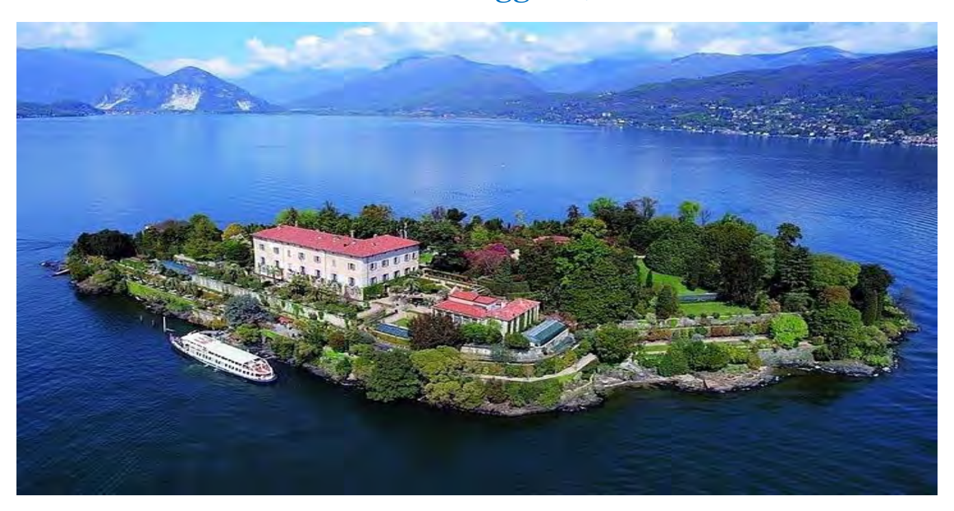
ISOLA MADRE : Following in the footsteps of Queen Victoria and other luminaries is the boat trip to neighboring Isola Madre, the island garden also owned by the noble Borromeo family since the 16th century and one of the oldest botanical gardens in Italy, a lush fantasy of a double-loggia villa, hedges of camellias, palms, papyrus, bananas, Brazilian parrots, peacocks and pheasants. (image above)

ISOLA BELLA : A private motor launch takes us to Isola Bella on Lake Maggiore for lunch and to visit the "tentiered wedding cake" garden from the 17th century, which is, as writer Edith Wharton describes, "richly ornamented with vases, statues and obelisks, jasmine, myrtle and pomegranate." Nothing has been altered, including the island's Baroque palace, to be visited as well, with its series of stunning Baroque reception rooms and amazing grottolike rooms decorated entirely with pebbles and shells. (three images right and below)